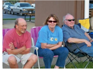
Come out and help us root for our guys!!!